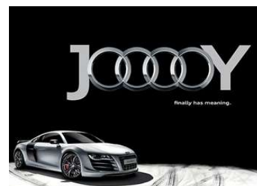
( https://www.audi.com )